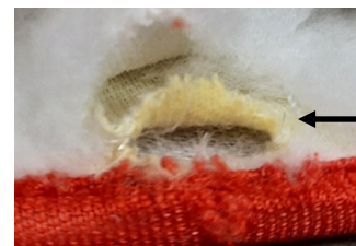
Boa and Kevlar lining